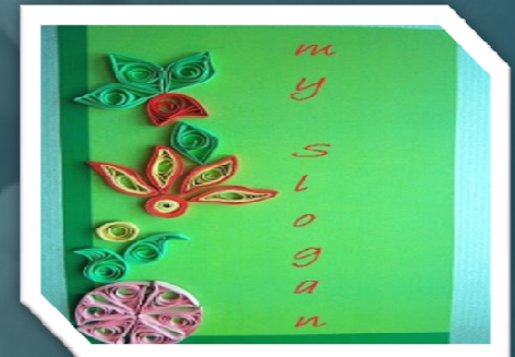
Logo & slogan design